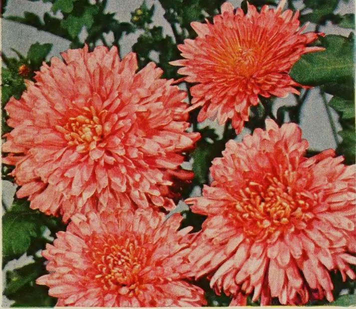
ADORABLE. 75c each; 3 for $2.00